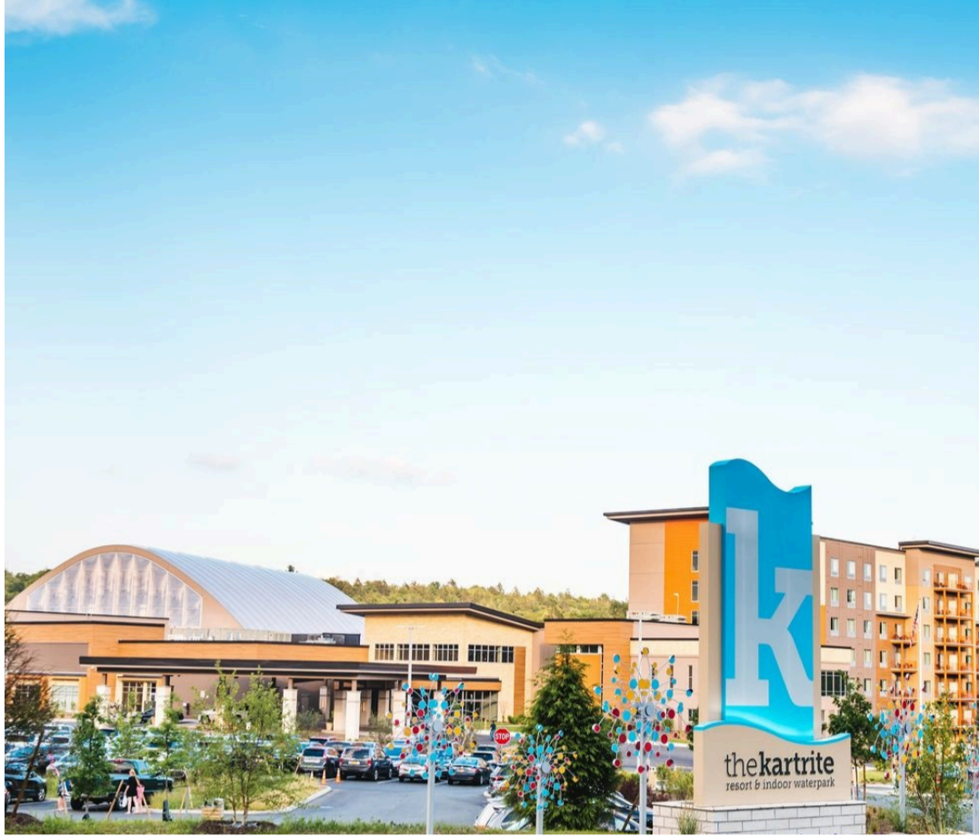
Front of the Property from the Road

The Kartrite Resort & Indoor Waterpark is like nothing New York's Catskills has ever seen before. With the USA's most modern, state of the art, indoor waterpark, 324 exquisitely designed suites, and a fantastic lodge experience set right in the mountains, the Kartrite Resort delivers an unbelievable family adventure for all ages! Nestled in the historic Catskills region of New York State, The Kartrite Resort & Indoor Waterpark is less than 2 hours from New York City, Northern New Jersey, Pennsylvania and Connecticut. Situated just a 3-wood away from Resorts World Casino, and home to the Catskill's largest indoor waterpark, The Kartrite has completely rethought the idea of the perfect family resort. Splash the day away on thrilling waterslides! Surf an endless wave while enjoying a view of the heart of the Catskills. Satisfy your inner iron chef at any one of our innovative restaurants. Or test your luck at our neighboring Resorts World Casino. Think way outside the box. Throw a party, plan your dream wedding, or schedule a corporate outing. No matter your adventure, The Kartrite Resort & Indoor Waterpark offers a modern and stylish Catskills resort experience for the entire family.